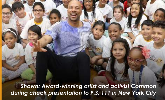
Shown: Award-winning artist and activist Common during check presentation to P.S. 111 in New York City