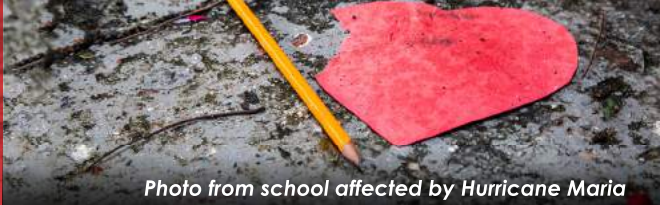
Photo from school affected by Hurricane Maria

In 2018, AdoptAClassroom.org became more active in disaster relief for classrooms around the country. When three major hurricanes hit the U.S. in 2017, we learned that we are uniquely positioned to provide effective support to schools and teachers affected by disaster. Why? Our new technology enabled us to react quickly, providing donors with an immediate way to contribute. Our deliberate approach to evaluating need among our nationwide network of teachers enabled us to distribute funds in a targeted manner to where they were needed most. Finally, the flexibility that we give teachers to spend their funds on exactly what they need, when they need it, over the course of one year ensures that donor contributions are spent in the best possible way to benefit students.